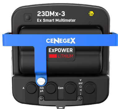
23DMx-3 Ex Smart Multimeter