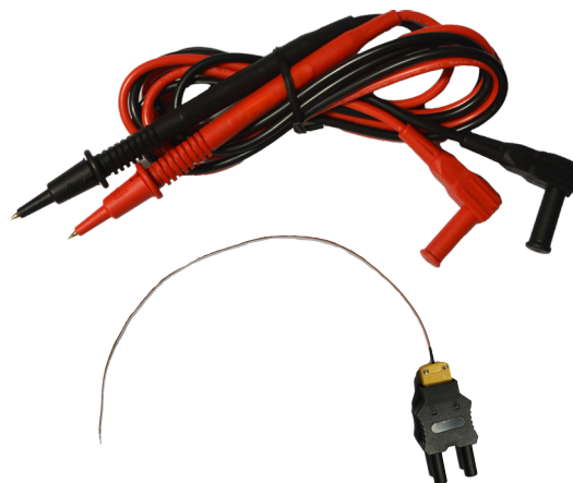
Cat2 test leads